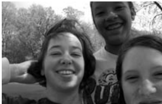
ABOVE AND BELOW: Faces of youth at the Syracuse area 2005 Franciscan Earth Club Retreat.

The early Franciscan movement was also a youth movement. A significant proportion of the early Franciscan movement was led by young people, inspired by Francis and Clare, and attracted to Christ and his Gospel of love. As Secular Franciscans, we continue that tradition by recognizing and nurturing the Franciscan charism in young people today. Although the number of young people involved in our Secular Franciscan Order has declined over the decades, there is a new spirit – a young one – blowing throughout our Order. The Fran-