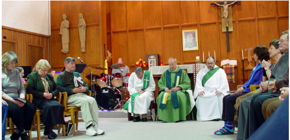
New national leaders during a reflective moment at their installation Mass.

He holds master's degrees in nursing and education, a C.A.S. in gerontology, and a doctorate in adult education.